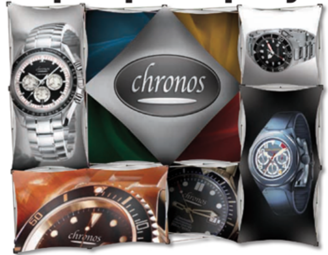
GeoMetrix™ Pop-Up Kit A shown with 10 full-color banners. Please visit our website to see all of our kit options.

Included with kits A & B Included with kits C, D, E & F