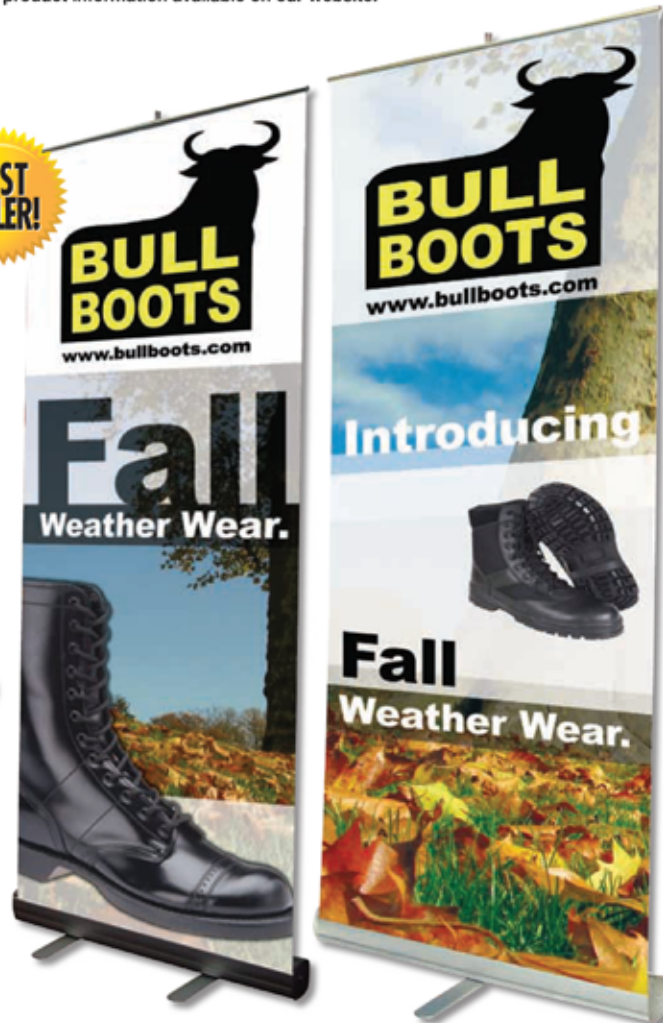
31.5" Economy Retractor™ shown.

• Graphic templates and product information available on our website.